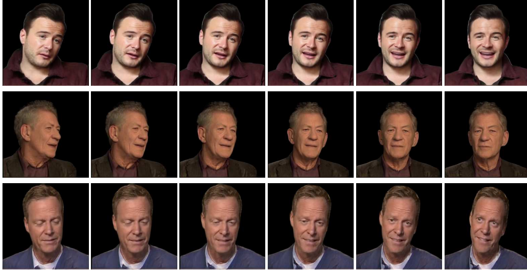
Figure 4: Reenactment by interpolation between two pose vectors across spherical trajectory in the pose descriptor space. Our system successfully creates visually smooth and identity preserving reenactment.

except FSTH+, which is slightly better in one of the metrics but much worse in the other, and which benefits from an external keypoint detector.