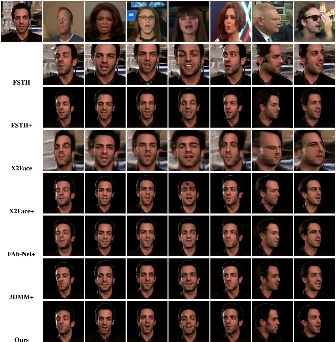
Figure 5: Comparison of cross-person reenactment for several systems on VoxCeleb2 test set. The top left image is one of the 32 identity source frames. The other images in the top row are pose drivers. Our method better preserves the identity of the target person and successfully transfers the mimics from the driver person.

with capturing some subtle mimics, especially gaze direction (though it still does a better job than keypoint descriptors that lack gaze representation altogether). Another obvious avenue of research is learning pose descriptor and the