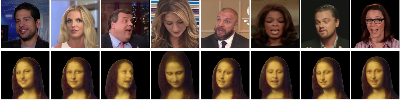
Figure 1: Being a Mona Lisa. Our system can generate realistic reenactments of arbitrary talking heads (such as Mona Lisa) using arbitrary people as pose drivers (top row). Despite learning in an unsupervised setting, the method can successfully decompose pose and identity, so that the identity of the reenacted person is preserved.

X2Face [39] pose descriptors are used. Additionally, we analyze the quality of learned latent pose descriptors for such tasks as landmark prediction and pose-based retrieval.